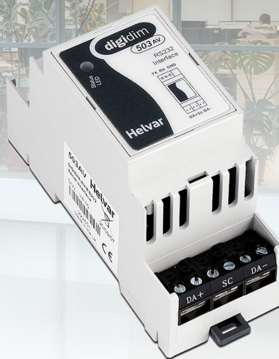
503 AV Interface