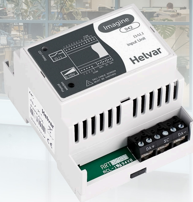
942 Input Unit