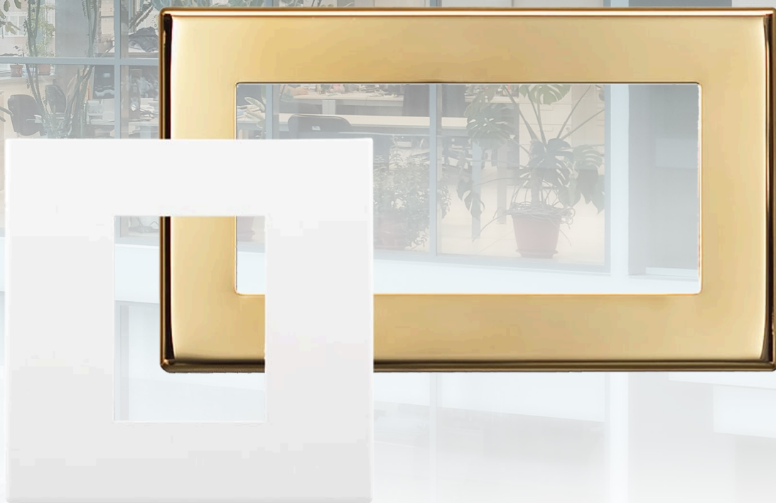
23x Frame kit