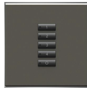
164xx: 4 Scenes + Off