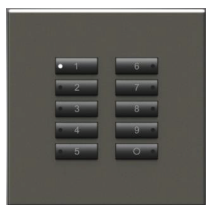
169xx: 9 Scenes + Off