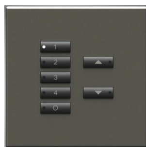
165xx: 4 Scenes + Off + Up/Down