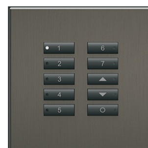
166xx: 7 Scenes + Off + Up/Down